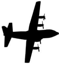
2 C130 Hercules