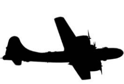
1 Washington (B29)