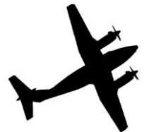
20 King Air